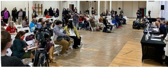
On Dec. 15, 2021, the state held a heavily attended public hearing on the ICS application at Kilburn Mill in New Bedford. If you were unable to attend, Jan. 7th is your last chance to weigh in on this important issue and its impact on NBPS.

https://www.doe.mass.edu/news/news.aspx?id=26618